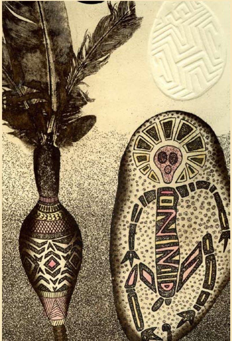
artwork reproduced courtesy of the artist, Peter Lowe

Lunch & morning tea is not included in the price.